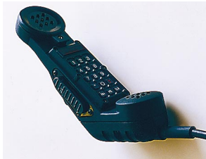
RF-3575 Remote Access Unit (RAU)