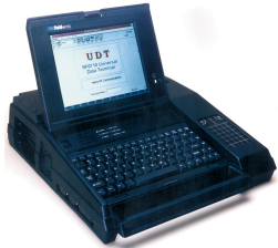
RF-6710 Laptop Data Terminal