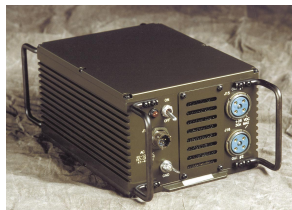
RF-5051, RF-5052, RF-5055 and RF-5056 Power Supplies