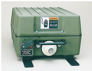
RF-382A-15 Fast Tune Antenna Coupler